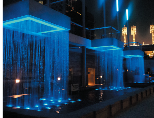
General Contractor: Monarch Construction Company